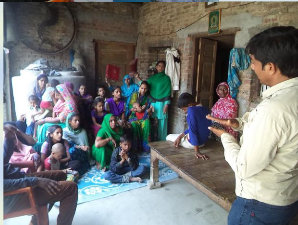
Village level meeting with community