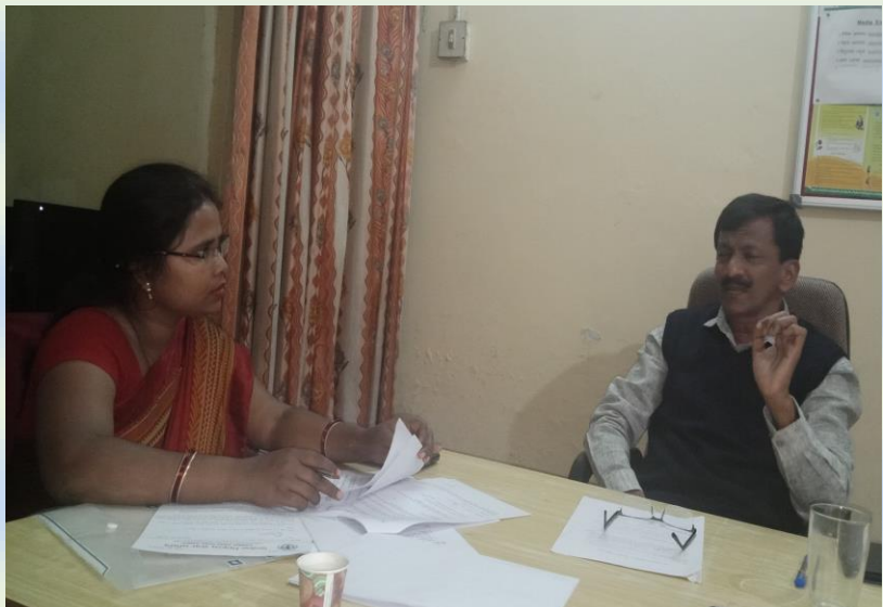
In Depth Interview with Deputy Medical Officer in District Basti

agenda of district and state-level officials using local evidence from community-