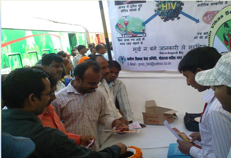
HIV/AIDS Awareness Stall

in the area. They may be involved as speakers in various forums and meetings. Any other activities may be planned in close coordination with SACS and local networks.