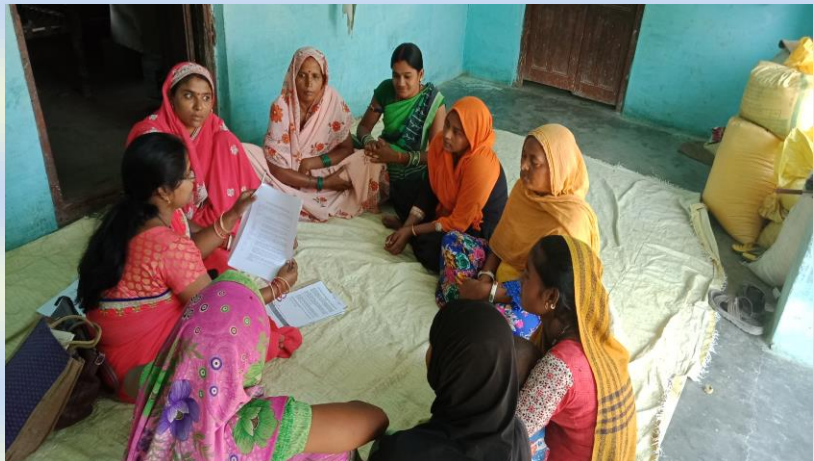
Focus Group Discussion in District Bast

Abortion is one of the leading causes of maternal death all over the world. Abortion is also much contested issues in many places. However India is one country where abortion laws are very liberal. A large number of abortions continue to be conducted illegally, using dangerous methods and it construes large proportion to the over one hundred thousand maternal death that took place every year in country. GVSS is implementing Amplify Change Project to strengthening SRHR