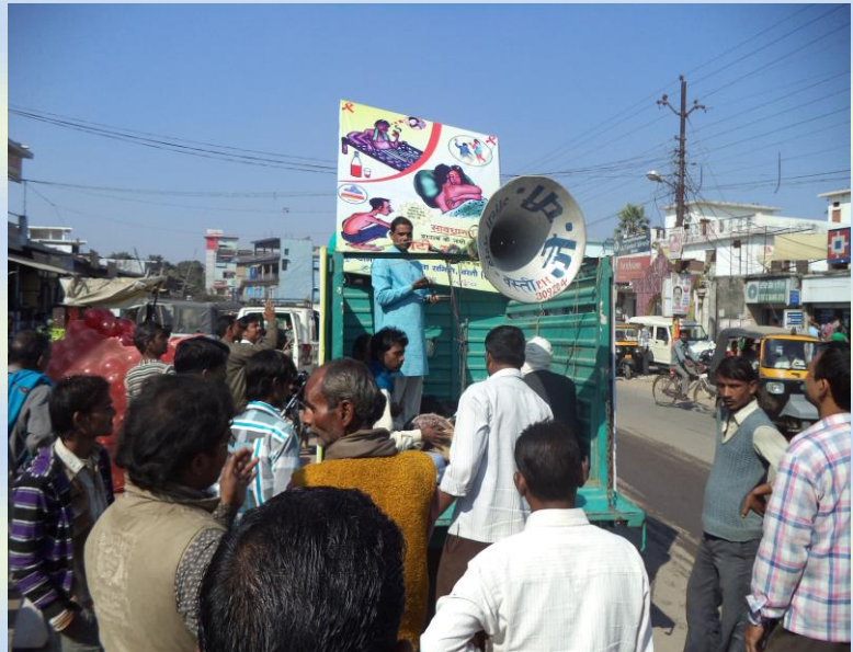
Awareness Activities through Mid-Media

new villages, villages with high outmigration, villages planned to set up information centre etc. These meetings are to be planned with other activities of the project such as planning health camps, IEC folk activities, mothers meeting and SHG meetings. These meetings are to be attended by panchayat leaders, Village Health and Nutrition Sanitation Committee members, ANM, ASHA, Anganwadi Workers, SHG members and other members. The meetings are planned to mobilize support for different activities. Hence, before the meetings all the possible stakeholders are contacted and sensitized about the project so that during the meeting they participate and contribute meaningfully.