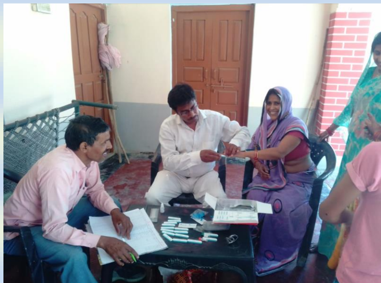
HIV Screening at Village Level by trained supervisor