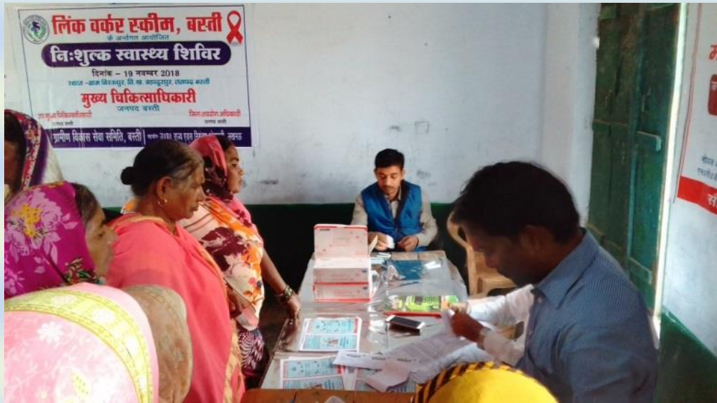
Health Checkup during Health Camp

especially during festivals when migrants return to their villages. This helps everybody to get their health checked up as well as undergo HIV counseling and testing. A health camp was organized with the support of U.P State Aids Control Society in Villages of District Basti with the objective to know about the situation of HIV in the people of Village. Large numbers of people participated in the health camp.